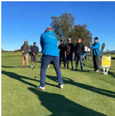
The Ray White Berry sponsored hole