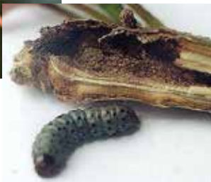
Right: Cedar tip moth larva ( Hypsipyla robusta ) emerging from a cedar stem