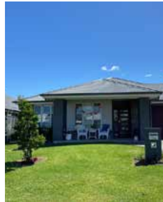
9 Brangus Close, Berry 4 Bed/2 Bath/2 Car $870pw