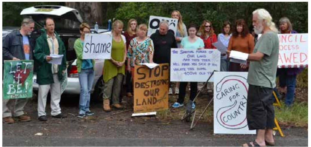
Protesters out in force at the felling of the 'Bum Tree'

If you would like to learn more visit the Berry Museum 11am-3pm on weekends and on Friday, Saturday, Sunday and Monday in school holidays.