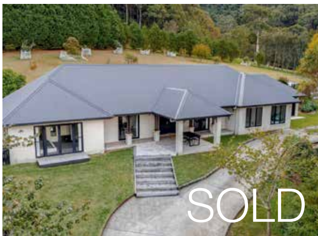
1395E BOLONG ROAD, COOLANGATTA $2,060,000