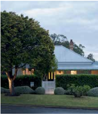
39 GEORGE STREET, BERRY