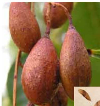
Above: Healthy woody fruit capsules split open in late summer to release the winged seeds

Thank you to the many people who have offered their seedlings for propagating in the nursery. The thousands of winged seeds that have fallen into gutters and water tank filters have germinated. It seems a shame not to be able to pot them all up, but the reality is that we don't have enough room in the nursery!