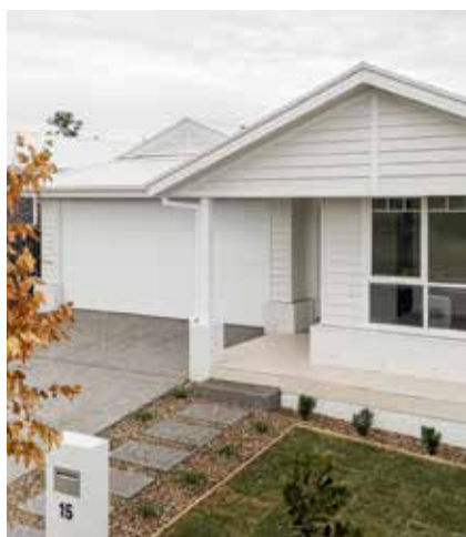
15 ALPHA ROAD, BADAGARANG