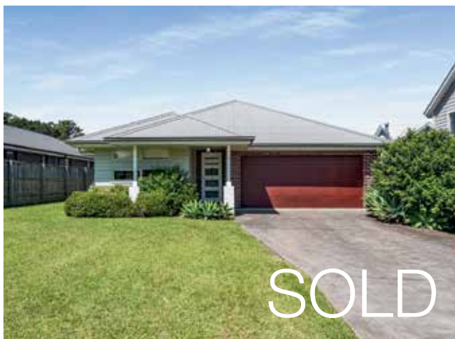
4 WOMACK CLOSE, BERRY CONTACT AGENT