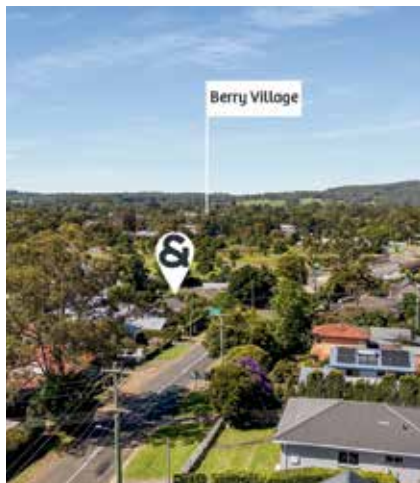
7 KANGAROO VALLEY ROAD, BERRY