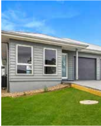
17a Myrtle Drive, Badagarang 4 Bed/2 Bath/1 Car