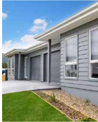
17b Myrtle Drive, Badagarang 4 Bed/2 Bath/1 Car