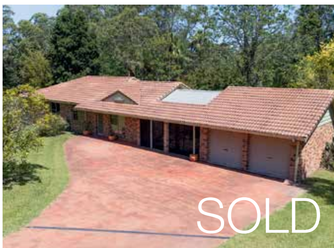
3 TALLIMBA ROAD, TAPITALLEE $1,260,000