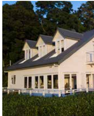
210 Tourist Road, Beaumont 6 Bed/3 Bath/1 Car $1500pw