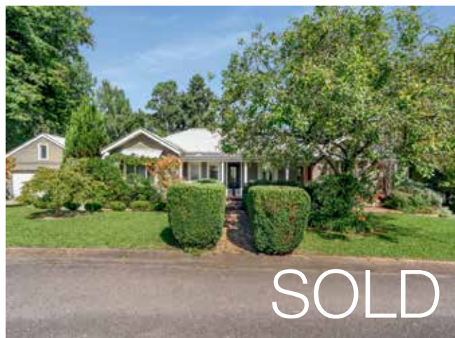
2 RECTORY PARK WAY, KANGAROO VALLEY $1,630,000