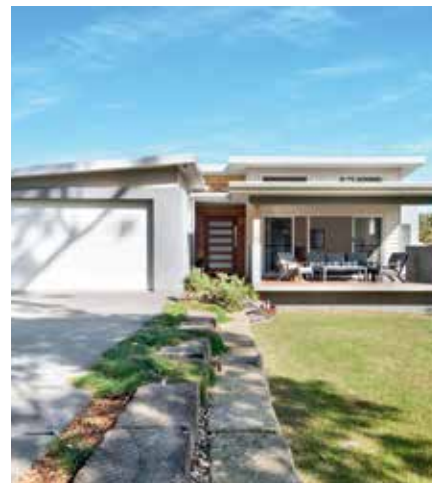
12 SCOTT STREET, SHOALHAVEN HEADS