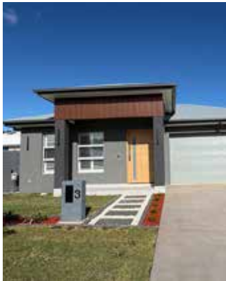
3 Galaxy Close, Badagarang 4 Bed/2 Bath/2 Car $800pw