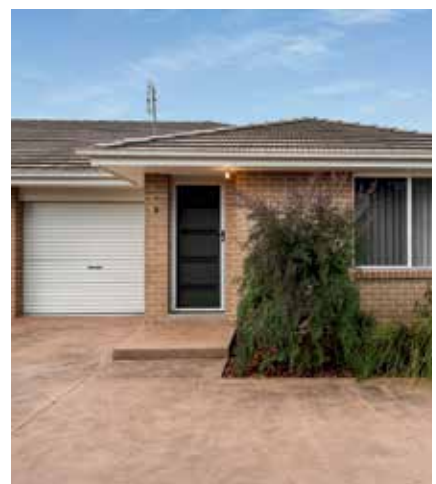
2/14 HANOVER CLOSE, SOUTH NOWRA