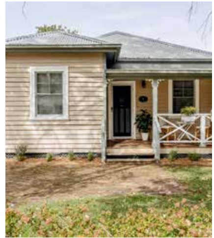
40A CLARENCE STREET, BERRY