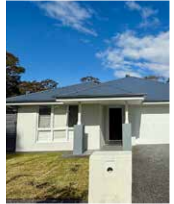
43 Corymbia Way, Badagarang 4 Bed/2 Bath/2 Car