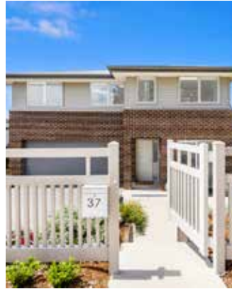
37 Lancaster Drive, Badagarang 5 Bed/2 Bath/2 Car