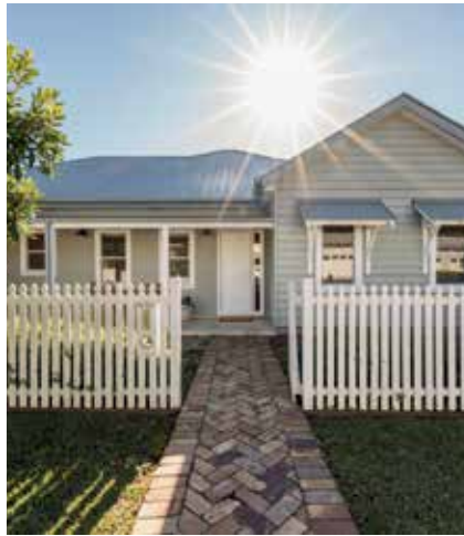
6/34 HUNTINGDALE PARK ROAD, BERRY