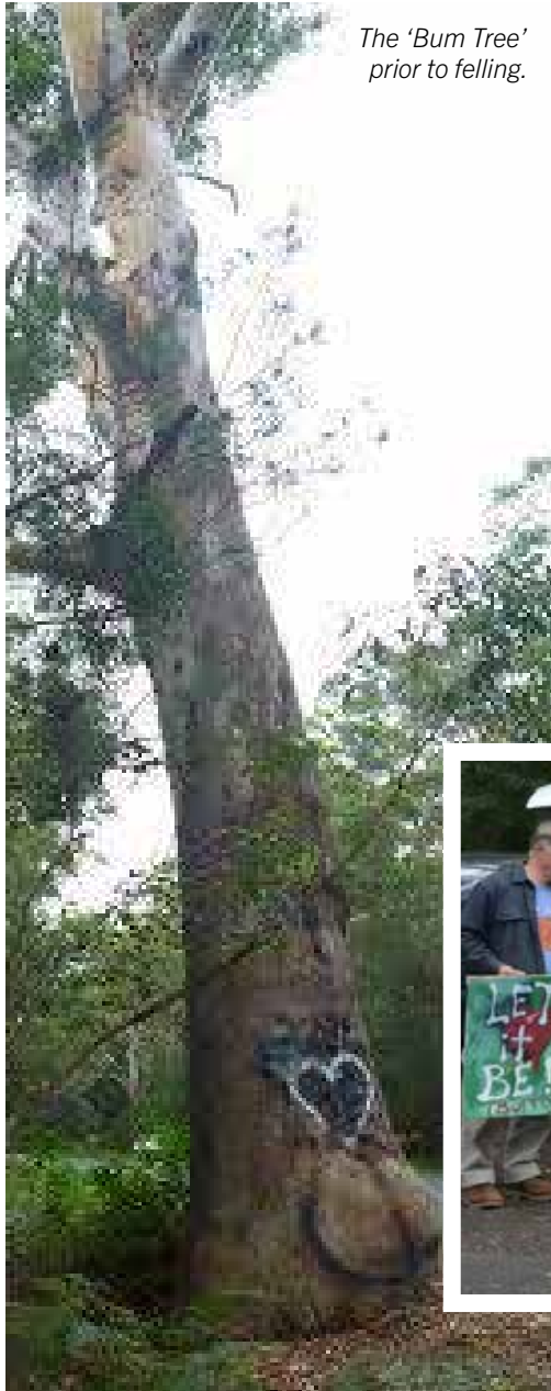
The 'Bum Tree' prior to felling.

A cross section taken from this large old-growth Blackbutt tree ( Eucalyptus pilularis ) situated on the verge of Gerro Road just north of its intersection with Beach Road, is in the care of, and on display at the Berry Museum.