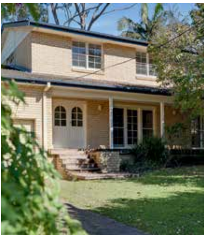
12 PRINCESS STREET, BERRY