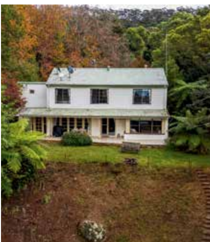
408 TOURIST ROAD, BEAUMONT