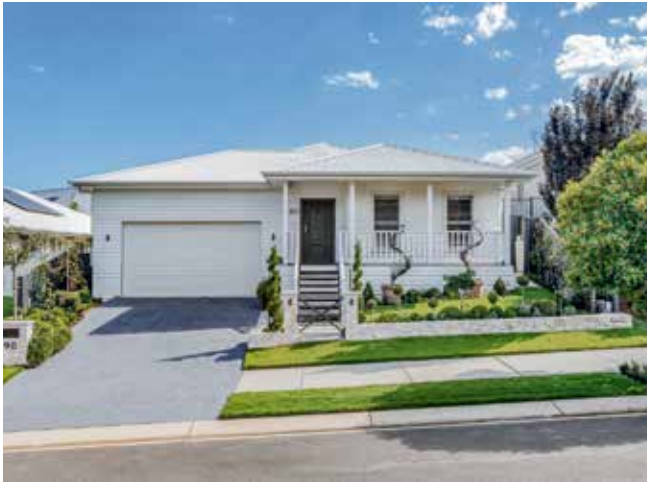
90 PARKER CRESCENT, BERRY

ELEVATED LUXURY, THOUGHTFULLY DESIGNED & IMPECCABLY EXECUTED