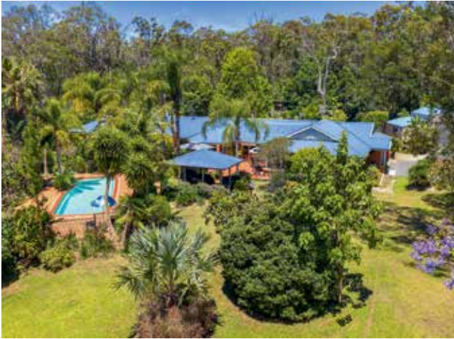
407B BENDEELA ROAD, KANGAROO VALLEY RETREAT ON 5 ACRES WITH POOL & DUAL-LIVING FLEXIBILITY