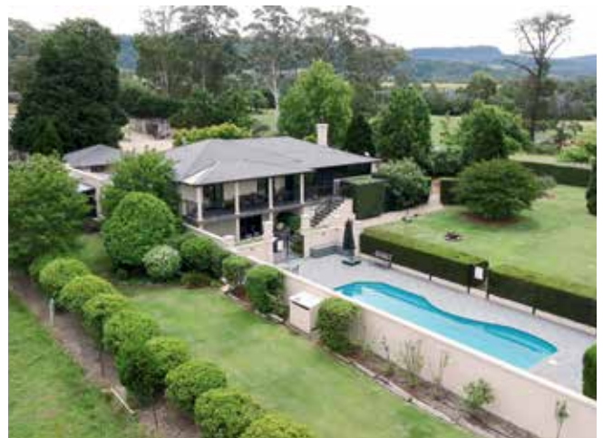
29 STRONGS ROAD, JASPERS BRUSH

DREAM, DESIGN, BUILD - YOUR BERRY OPPORTUNITY AWAITS