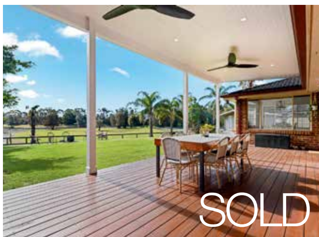
24 SPOONBILL PLACE, ALBION PARK RAIL SOLD FOR CONTACT AGENT