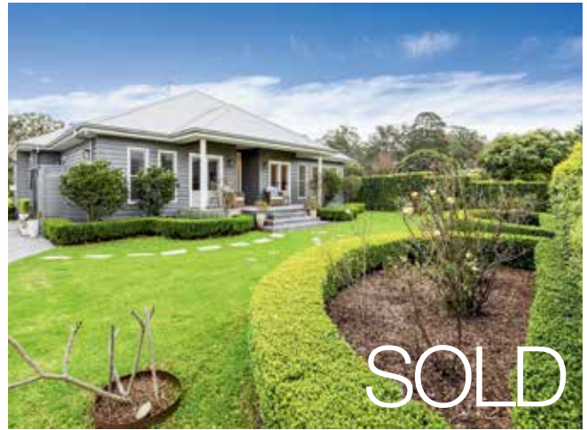
62C KANGAROO VALLEY ROAD, BERRY SOLD FOR $2,750,000