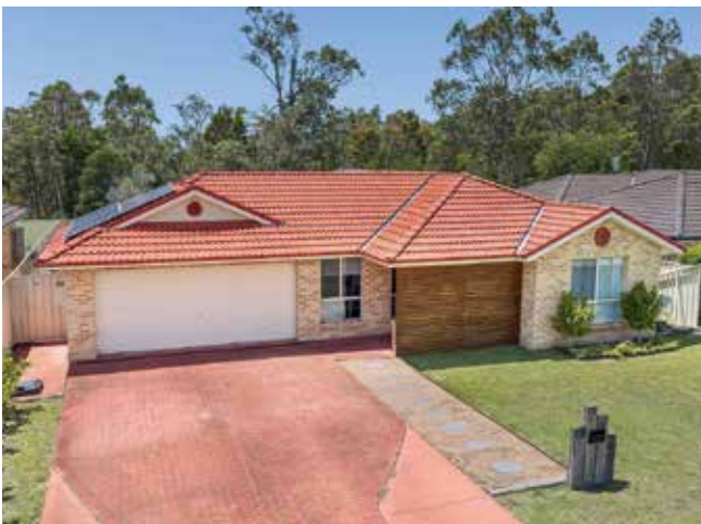
7 LIBERTY ROAD, WORRIGEE FAMILY LIVING MINUTES FROM WORRIGEE SHOPS & NOWRA CBD