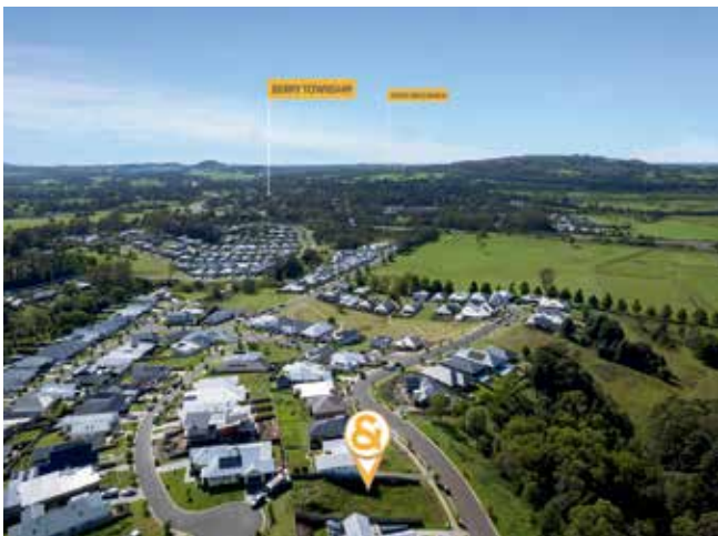
40 PARKER CRESCENT, BERRY

PERFECT BLEND OF COUNTRY CHARM & SUBURBAN CONVENIENCE