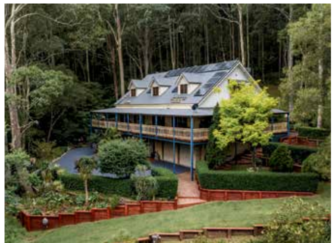
126 EDWARD WOLLSTONECRAFT LN, COOLANGATTA

SET AGAINST STUNNING COUNTRYSIDE & ESCARPMENT VIEWS