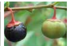
Little breynia fruits