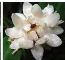
Beetle pollinating the flower