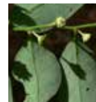
Little breynia flowers

Little breynia – Breynia oblongifolia Little breynia is host to thrips and leaf flower moths which pollinate the tiny flowers. The pollinators lay their eggs in the flowers and fruits where the larvae opportunistically eat out some or all of the developing seeds.