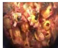
Wasps hatching inside the fig

Little breynia – Breynia oblongifolia Little breynia is host to thrips and leaf flower moths which pollinate the tiny flowers. The pollinators lay their eggs in the flowers and fruits where the larvae opportunistically eat out some or all of the developing seeds.