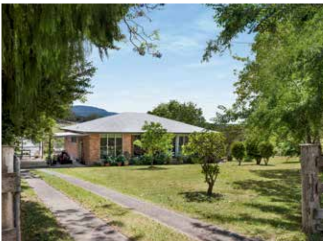
60 CROZIERS ROAD, JASPERS BRUSH

COUNTRY-SIDE ESCAPE WITH INCOME POTENTIAL