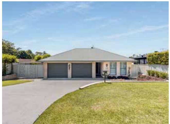
4 LYNDBURST DRIVE, BOMADERRY EFFORTLESS LOW-MAINTENANCE LIVING