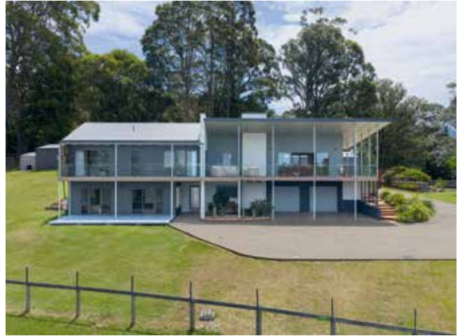
1186A ILLAROO ROAD, TAPITALLEE RURAL LIVING IN TAPITALLEE'S MOST SOUGHT-AFTER ENCLAVE