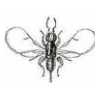
Female Fig Wasp