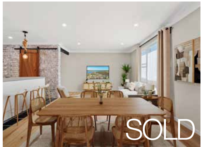
7/92 JERRY BAILEY ROAD, SHOALHAVEN HEADS SOLD FOR $715,000