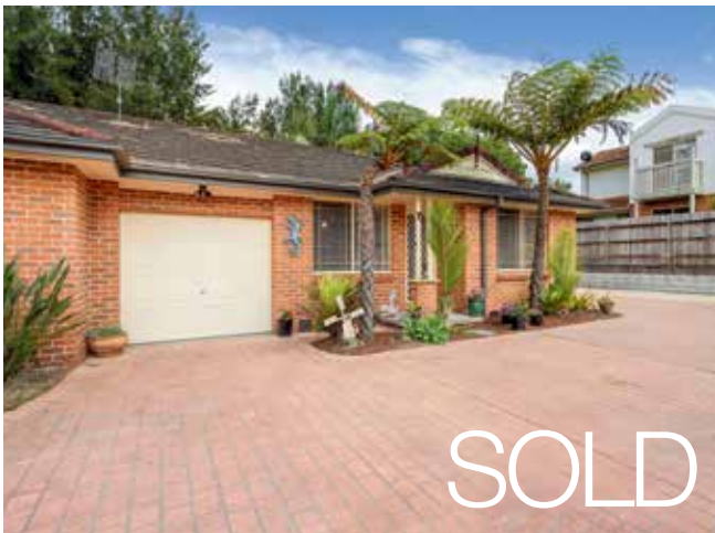
3/35 QUEEN STREET, BERRY SOLD FOR $825,000