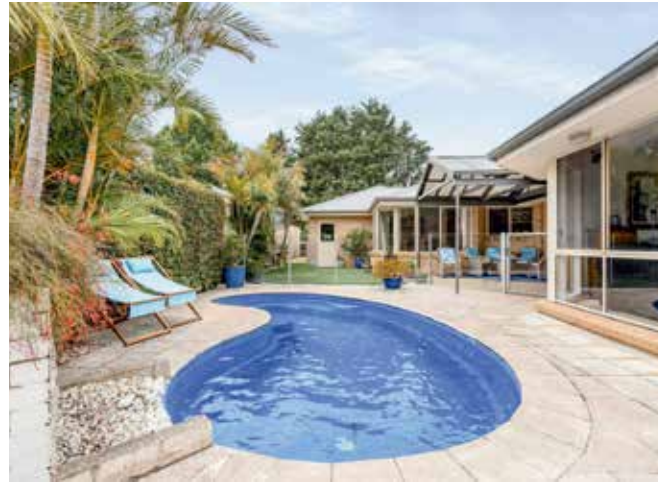
6A GWENDA AVENUE, BERRY

ELEVATED LUXURY, THOUGHTFULLY DESIGNED & IMPECCABLY EXECUTED