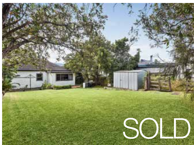
1A AVONDALE ROAD, DAPTO SOLD FOR $785,000