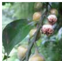
Flowers opening in the morning

Bolwarra – Eupomatia laurina Bolwarra's flower over a few weeks between Christmas and New Year. The unusual primitive flowers last only one day. The flower blooms in the morning, revealing a ring of creamy white fertile stamens which are shed by the afternoon, so the pollinator needs to find and pollinate the flower within that small window of opportunity. The flowers have a distinct smell (like nail polish remover) which attracts it's only pollinator, the co-dependent tiny wasp/beetle Elleschodes hamiltoni . Bolwarra is related to Magnolias, both plants evolved before the evolution of bees.