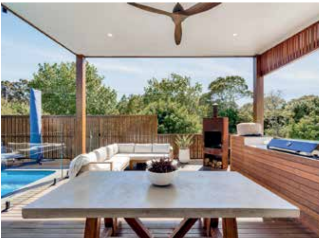
55 WALSH CRESCENT, NORTH NOWRA A STYLISH HOME DESIGNED FOR OUTDOOR ENTERTAINING