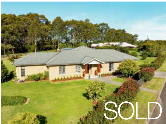
2 GLADIOLI VISTA, BOMADERRY SOLD FOR $1,455,000