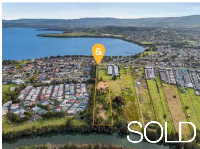
72 KANAHOOKA ROAD, KANAHOOKA SOLD FOR $3,300,000