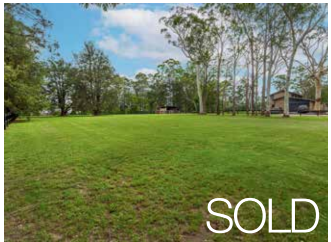
609 ILLAROO ROAD, BANGALEE SOLD FOR $920,000