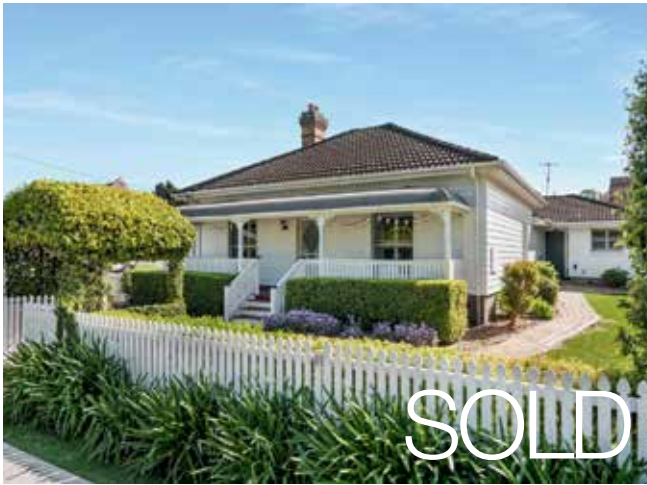
7 PRINCE ALFRED STREET, BERRY SOLD FOR $2,475,000