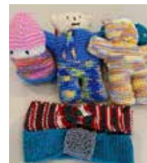
Samples of Barbara's knitting