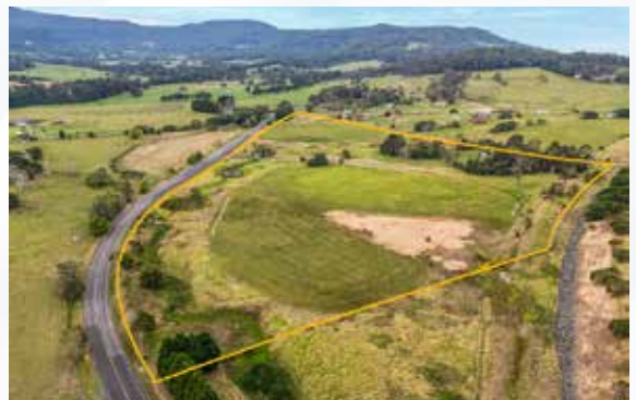
261 Donovan Road Broughton Village