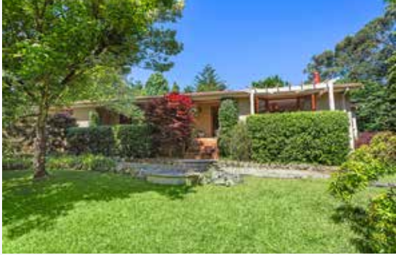
149B Kangaroo Valley Road Berry