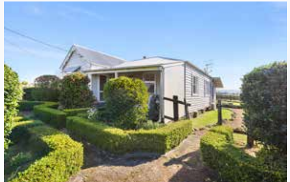
219 Hanigans Lane Bolong