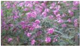
Indigofera australis - Indigofera

Grasses such as Bulbine bulbosa - Bulbine lily , Dianella caerulea - Dianella , Libertia paniculata - Branching flag grass , Lomandra species and the larger more dramatic Crinum pedunculatum - Crinum lily , have also flowered well this season.