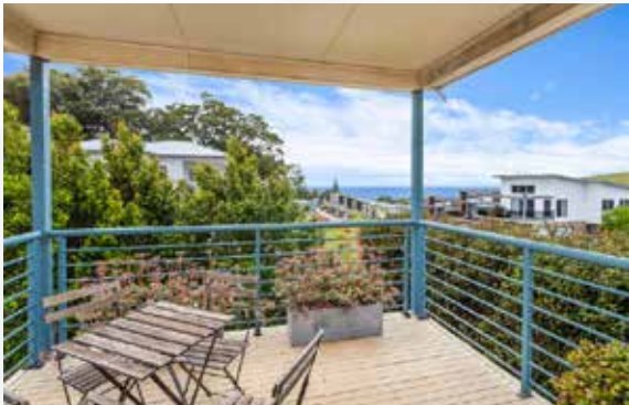
12/146-152 Fern Street Gerringong