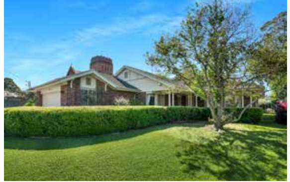
79 Albert Street Berry