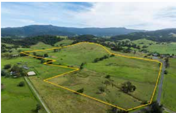
2 Toolijooa Road Toolijooa