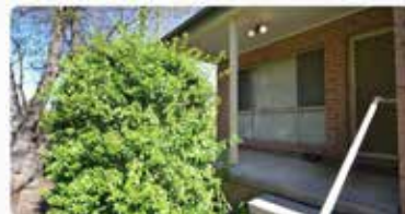
Albany Street OFF MARKET