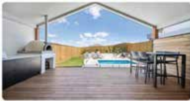
13B Tressider Close