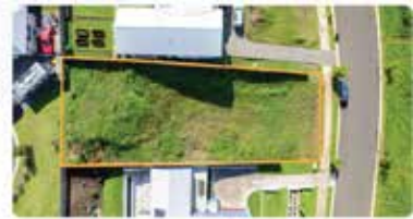
40 Parker Crescent