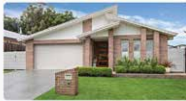
14 Brangus Close