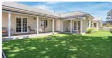
3/69 Albert Street