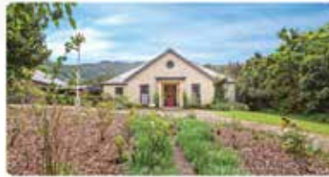
150 Bundewallah Road