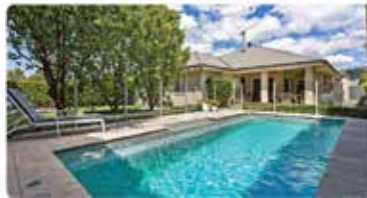
2 Boran Place