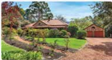
3 Sabal Close