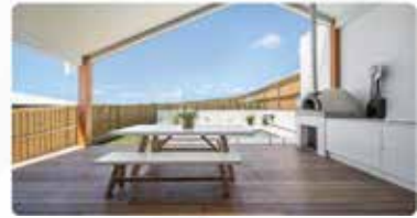
13A Tressider Close