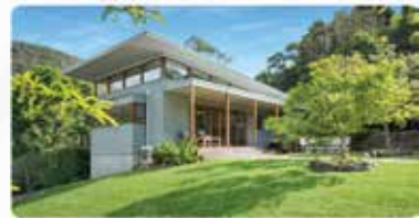
273 Bundewallah Road