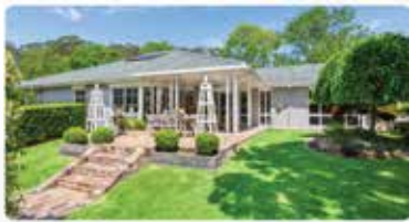
6 Thomas Close