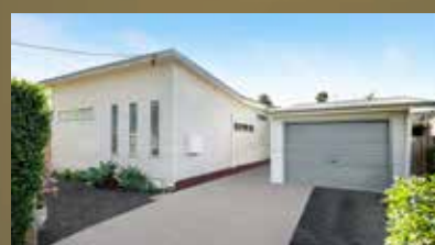
19 Queen Street Berry