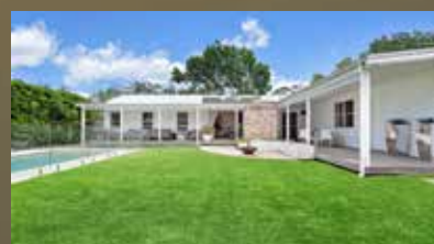
36 Clarence Street Berry