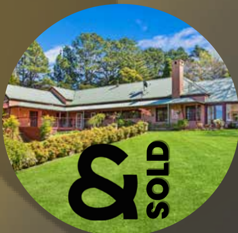
3/69 Albert St