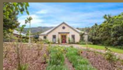
150 Bundewallah Rd Bundewallah