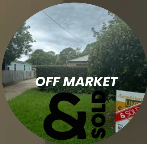
5/6 Albany St