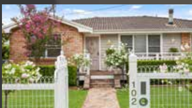
102 North Street Berry