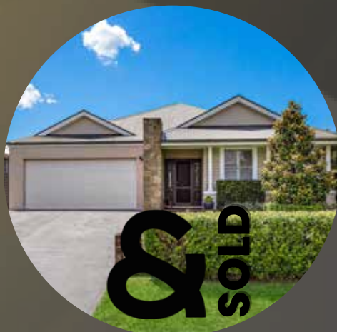
2 Boran Pl