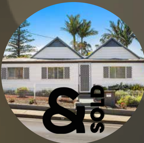
32 Belinda St