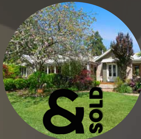
2 Rectory Park Way