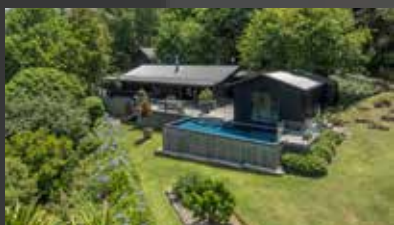
300A Mount Hay Rd Broughton Vale