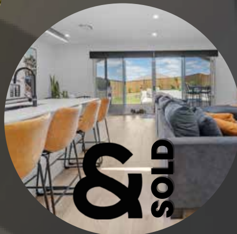
13a Tressider Cl