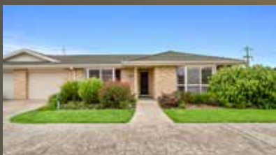
1/1 Davenport Road Shoalhaven Heads