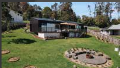
27 Connors View Berry