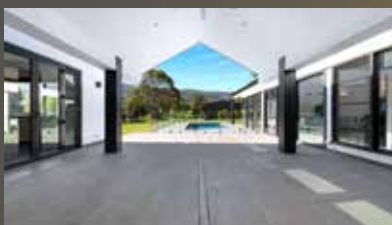
80 Boxsells Lane Meroo Meadow