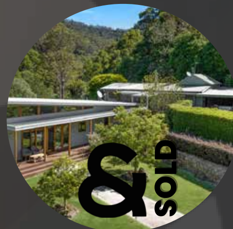
273 Bundewallah Rd