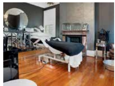
Short or Long Term

A rare business lease opportunity located on the top floor of 122 Queen St, Berry. Five generous sized offices (4 with ensuite) are available for short or long-term lease.