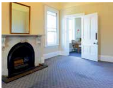
4 with Ensuite