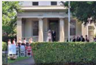
Private Garden and Fountain, Wedding front steps 2023, Community Group Leaders Meeting 2022.