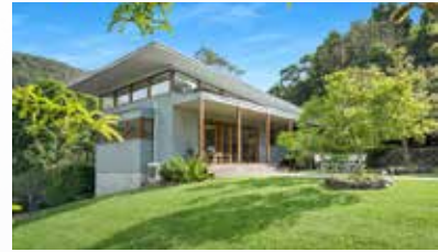
273 Bundewallah Road Berry