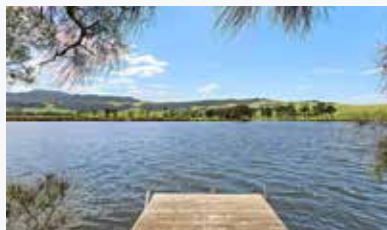
51 Werri Street Werri Beach