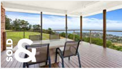
51 Saddleback Mountain Road Kiama