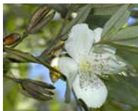
Pink wood – Simple white flowers with fluffy stamens