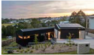
27 Connors View Berry