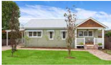
12 Ford Street Berry