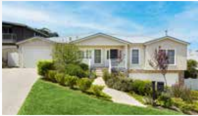
18 Womack Close Berry