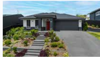
84 Parker Crescent Berry