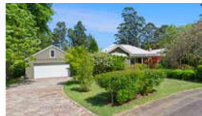
2 Rectory Park Way Kangaroo Valley