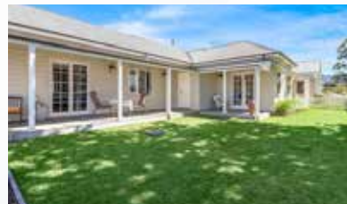
3/69 Albert Street Berry