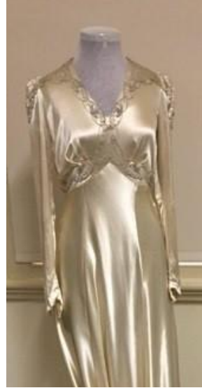
Oyster Satin Wedding dress. C1930s. Owner unknown.

Over the holidays you may have a chance to visit the Museum to see this new exhibition, and perhaps the 'mystery' dress mentioned above might look familiar to you, and you could help us discover its origins.