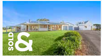
321 Bryces Road Far Meadow