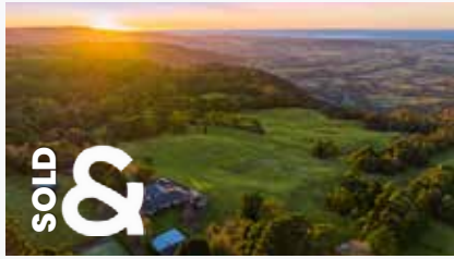
350 Tourist Road Beaumont