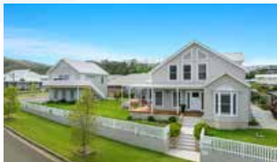
4 Connors View Berry