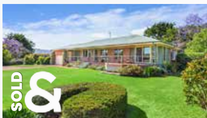
99B Harley Hill Road Berry