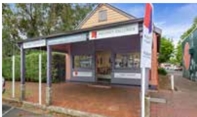
14 Alexandra Street Berry