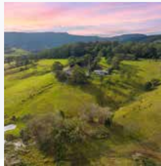
157 Donovan Road Broughton Village