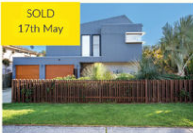
72 McIntosh Street Shoalhaven Heads