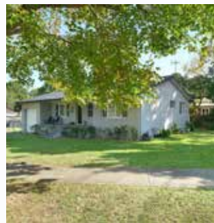
29 Edward Street Berry