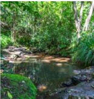
280 Tindalls Lane Berry