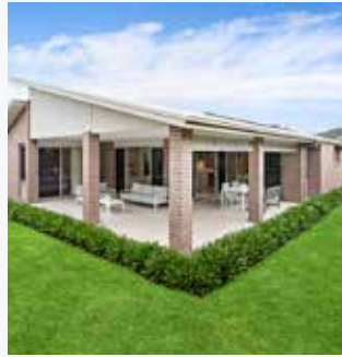
14 Brangus Close Berry