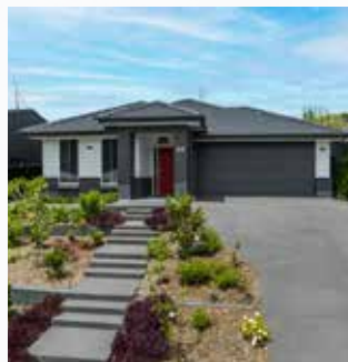
84 Parker Crescent Berry