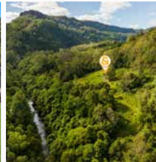
340A Brogers Creek Rd Brogers Creek