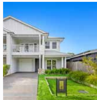
2/21 Albert Street Berry