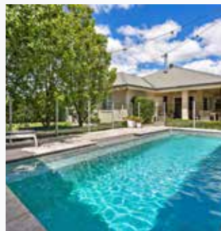
2 Boran Place Berry