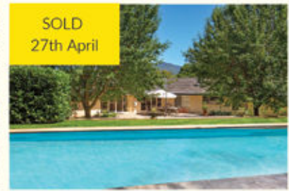
114 Foxground Road Foxground