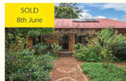
39 Clarence Street Berry

Would you like to know about any of the above?