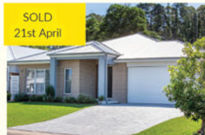
113 Parker Crescent Berry