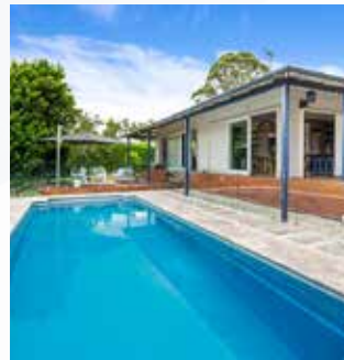
140 O'Keeffe's Lane Jaspers Brush