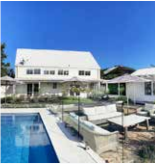
24 Prince Alfred Street Berry