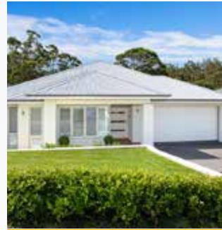
85 Parker Crescent Berry