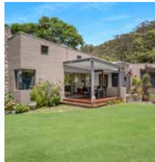
589 Woodhill Mtn Road Woodhill