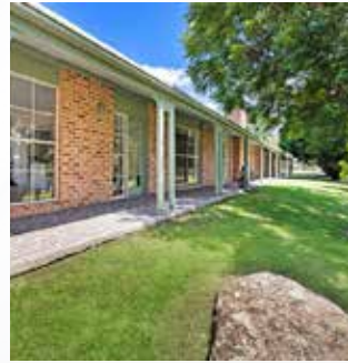
359A Coolangatta Road Far Meadow