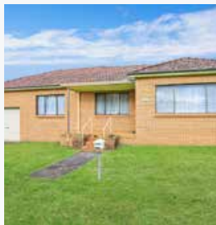
100 North Street Berry