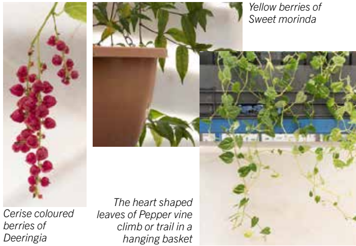
Yellow berries of Sweet morinda

Pepper vine becomes a giant climber and smothers trees that they use as support.