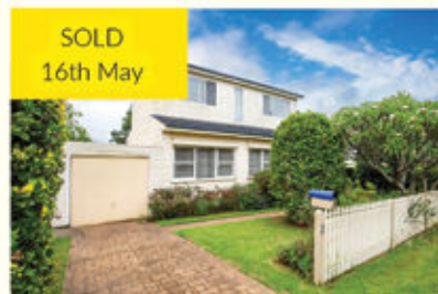
3 Kangaroo Valley Road Berry