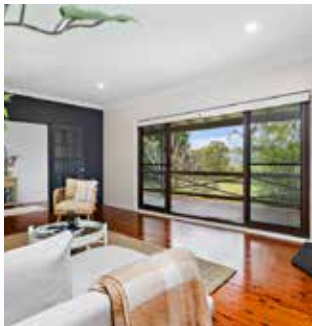
37 Houston Place Berry