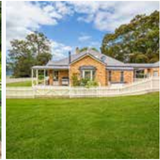
171C Strong's Road Berry