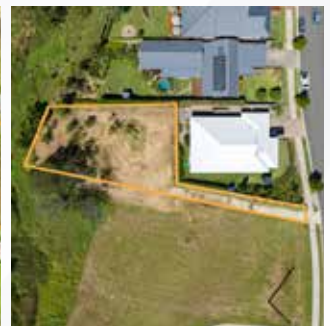
7 Hitchcocks Lane Berry