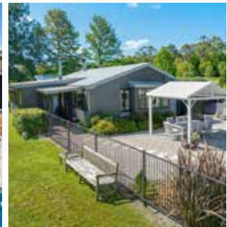
359D Coolangatta Road Far Meadow