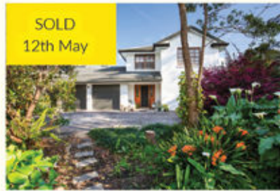
26 Princess Street Berry