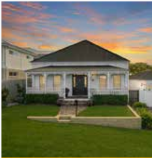
11 Tilgman Street Berry