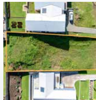
40 Parker Crescent Berry