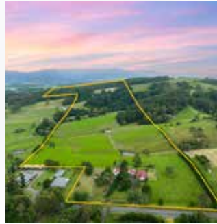
418 Coolangatta Road Berry