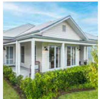
105 Parker Crescent Berry