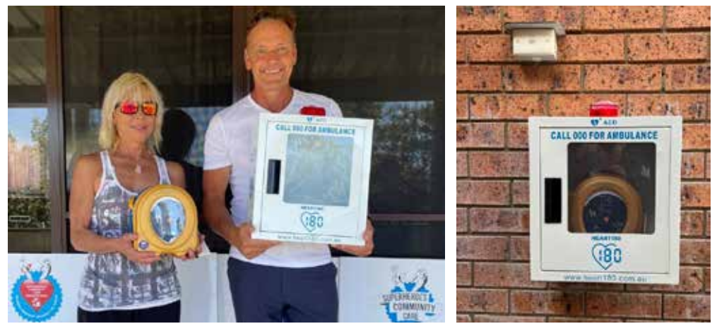
Pictured above: Superheroes Community Care River Retreat, 78 River Road, Shoalhaven Heads