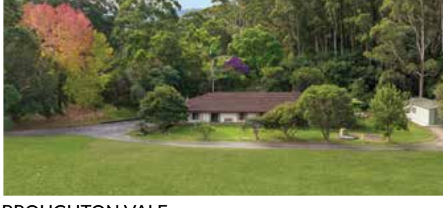
BROUGHTON VALE 50 Tullouch Road