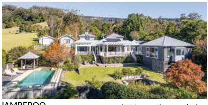
JAMBEROO 185 Wallaby Hill Road