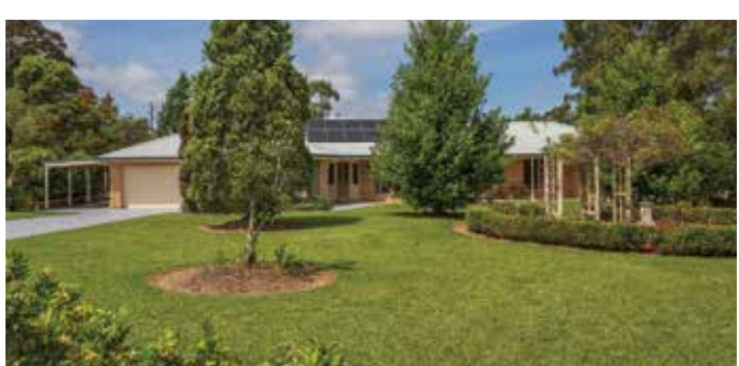
<u>}</u>2 3 1