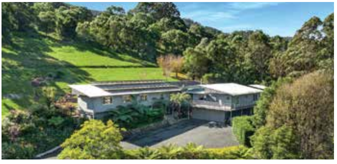
BERRY 256B Bundewallah Road