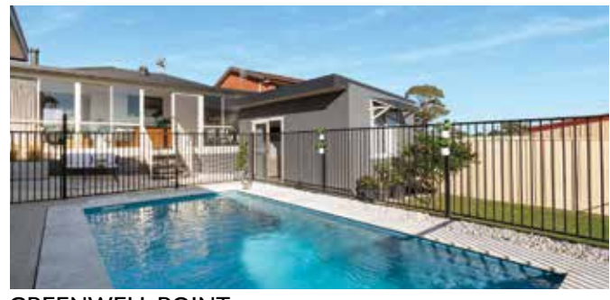
GREENWELL POINT 51 Greenwell Point Road