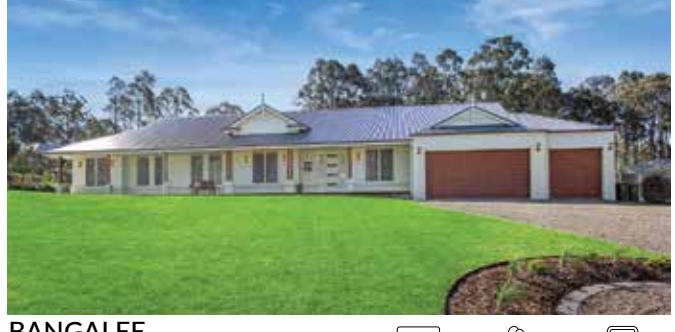
BANGALEE 22 Tallimba Road