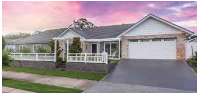
BERRY 19 Hitchcocks Lane