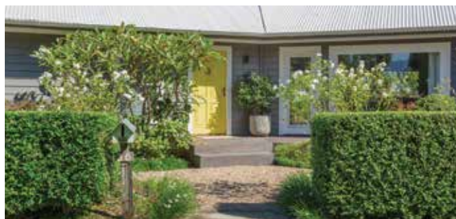
BERRY 36 Princess Street