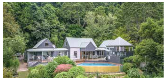
KANGAROO VALLEY 979A Moss Vale Road