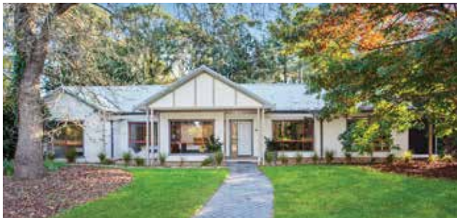
KANGAROO VALLEY 1 Rectory Park Way