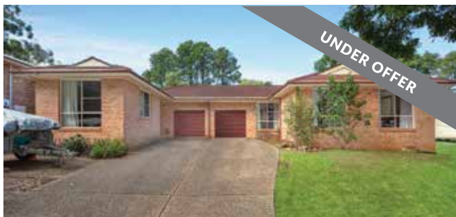
BERRY 52 George Street