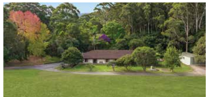
BROUGHTON VALE 50 Tullouch Road