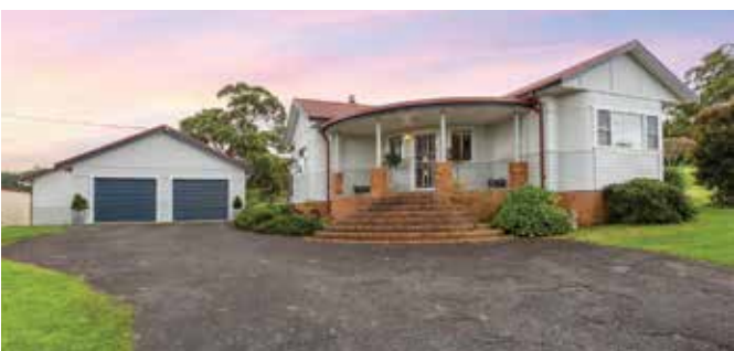
BERRY 418 Coolangatta Road