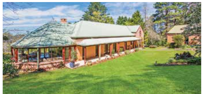
BERRY 170 Tourist Road