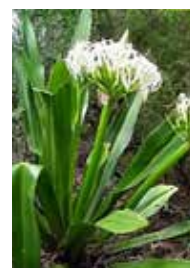
The Plants look like this: Left: Crinum pedunculatum Below: Rhagodia candolleana

Nursery hours - Wednesdays and Thursdays 3.30 - 4.30pm