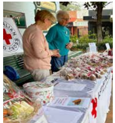
Anzac Biscuit Stall

If you wish to find out about becoming involved with or volunteering with the Red Cross contact the Berry Branch of the Red Cross (see Community Groups page of Town Crier for contact details), the Nowra Red Cross Office (1800621433) in Graham St Nowra or go onto the Red Cross website.